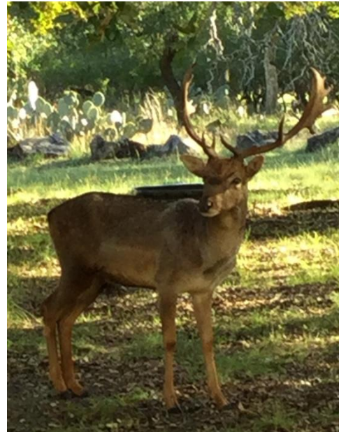
Look in Sandy's back yard!