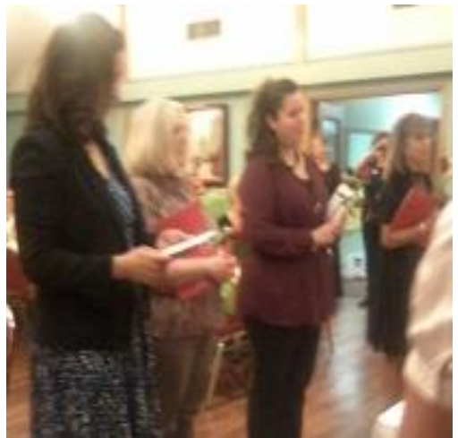
Initiates being inducted.