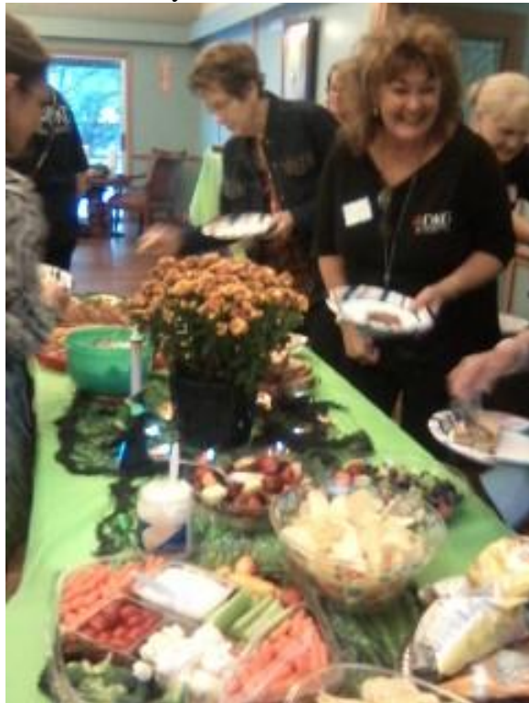
Lining up for goodies