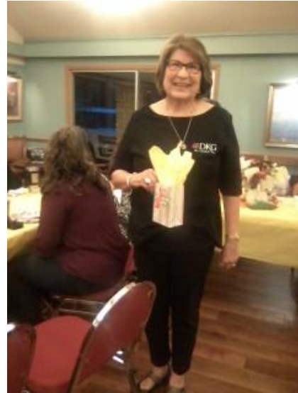
Clem hit the big time! Happy October birthday gift from Sandra, and the "Schools for Africa" raffle basket donated by Ruth. It raised $71.00!