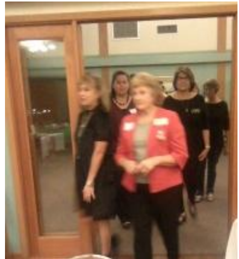
Initiates marching in.