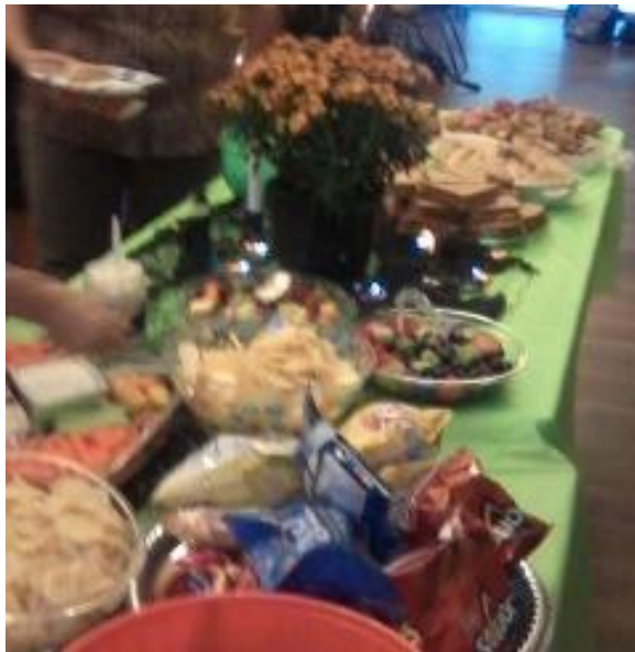
Buffet Table served by San Marcos ladies.