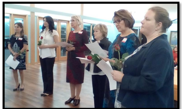
Remember these 2016 Initiates? How many can you name?