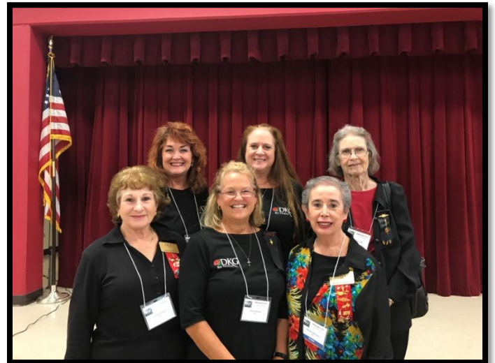
Closeup of special members! Wish we could all have attended.