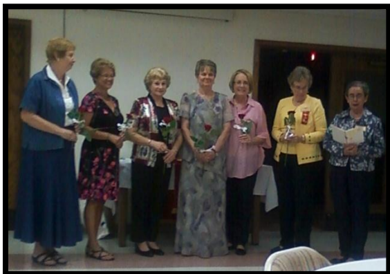
2012-14 Officers Looking Back!