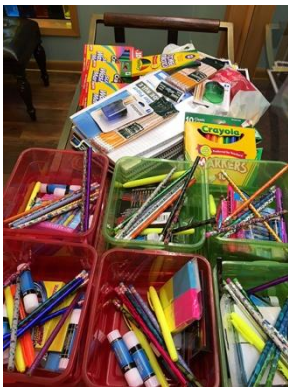
Supplies for teachers.