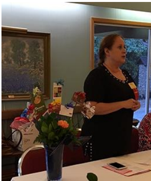
Pres. Tanya Presiding