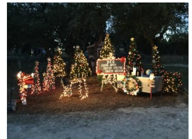
Finished Scene 2017