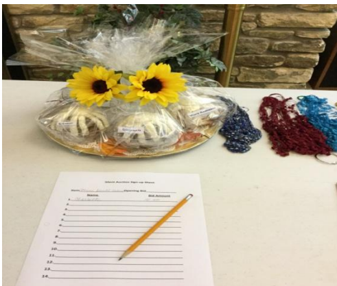
Miniature Bundt cakes and Nu necklaces