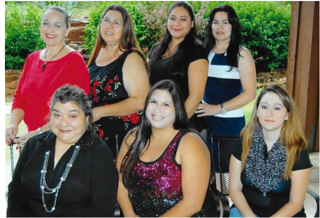
Hands of Hope (continued from last month.)

Source for forms and answers: http://www.dkgtexas.org Previous pictures are the Web Site All graphics from Microsoft Clip Art, Google Images, or DKG web file Pictures used by permission. www.nuchaptertxdkg.weebly.com