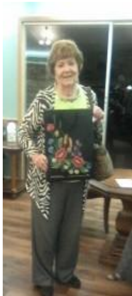
Virginia received the Global Awareness door prize. Four November birthday ladies won floral table decorations.

As you can see from these pictures, we need a volunteer to take pictures of our meetings each month. You would then upload them to me to use in the newsletter. Please step up!