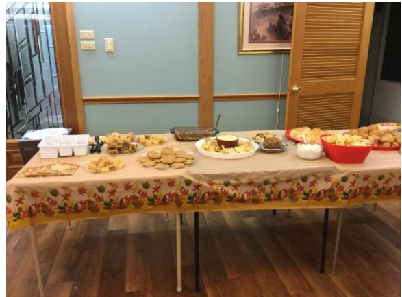
Table of delicious treats.