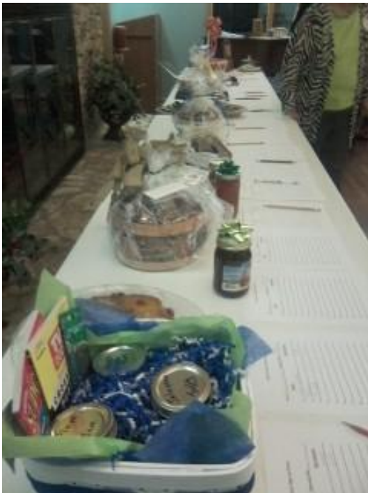
Some of the auction items – I got this basket of jellies. Thanks to whoever made it.

As you can see from these pictures, we need a volunteer to take pictures of our meetings each month. You would then upload them to me to use in the newsletter. Please step up!