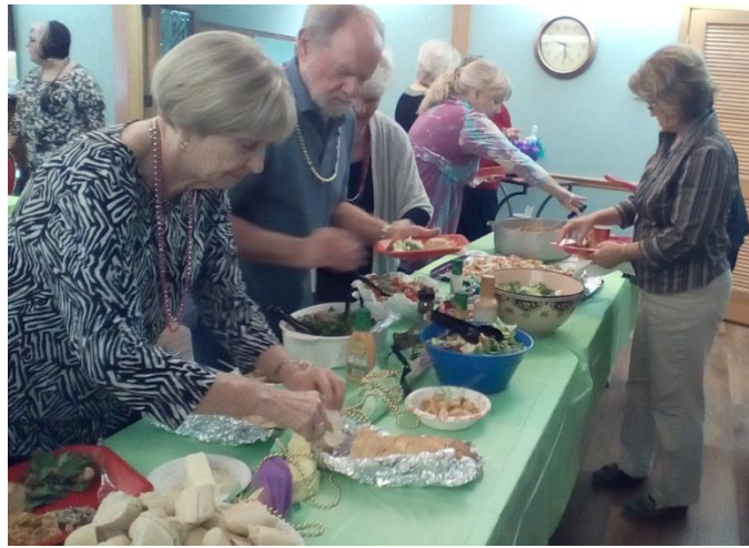
Enjoying the wonderful cuisine!