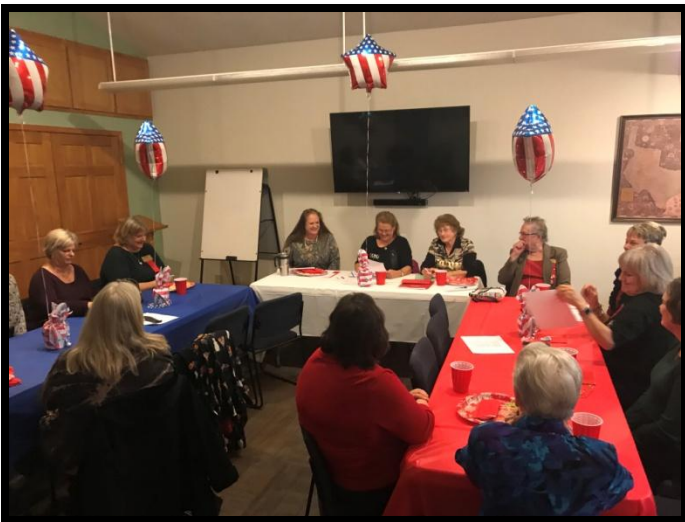
Members prepare for meeting at Wimberley Library