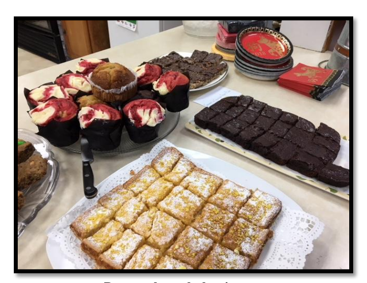
Desserts brought by sisters