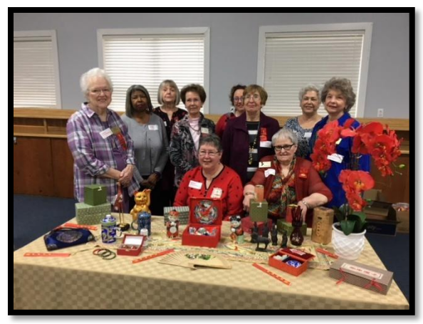
Tri Chapter Social guests Theta Kappa, Seguin