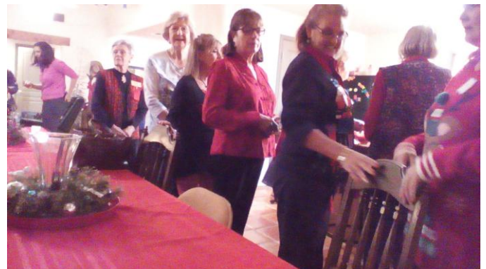
Lining up for dinner