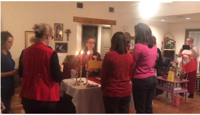
Observing the Ceremony