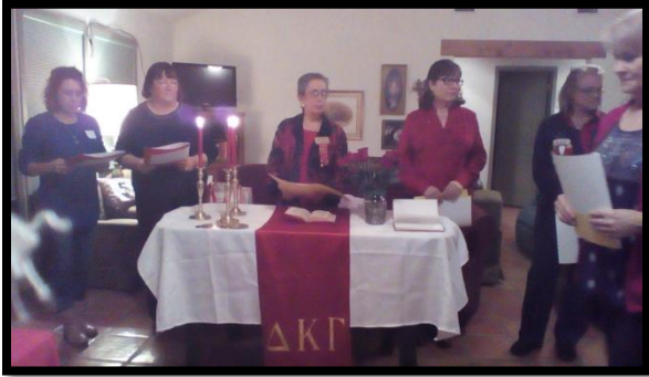
Ready for Initiation