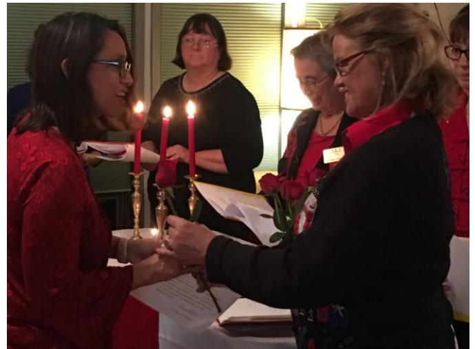
Presenting the Rose