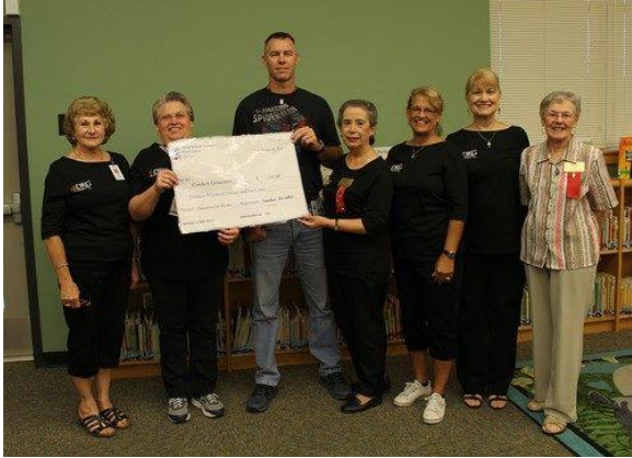
A look back at our first ASTEF