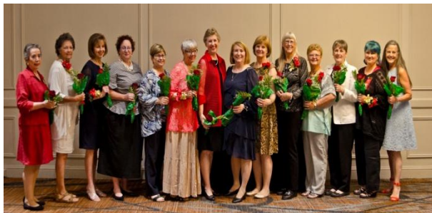
Area 7 Presidents Nu President on left.