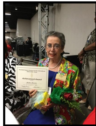
Before the tears started!