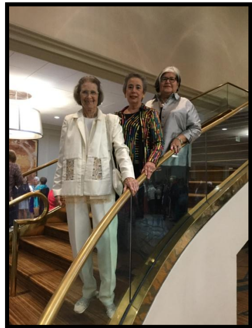
Going to the banquet!